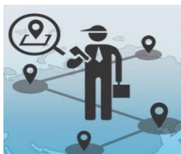
Factory Visits & Online Interviews