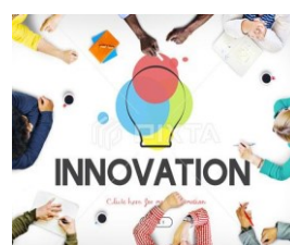
Other Customized Live Programs