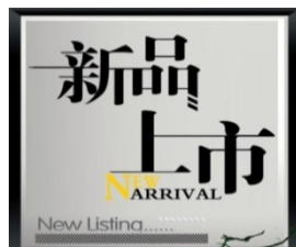
New Product Releases